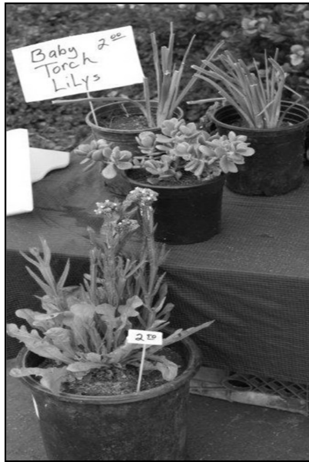
Plants made a debut at this year's Rummage Sale, thanks to our newest (and anonymous) Gardening Angel. For more on the Rummage Sale, see Page 8.