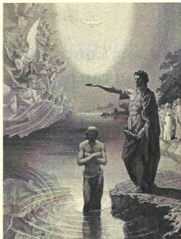
Baptism of Christ, by Grigori Gagarin Circa 1860